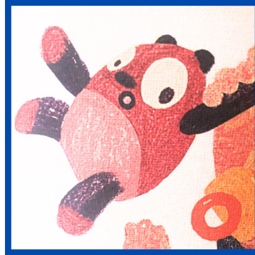
Artwork © Lincoln Agnew